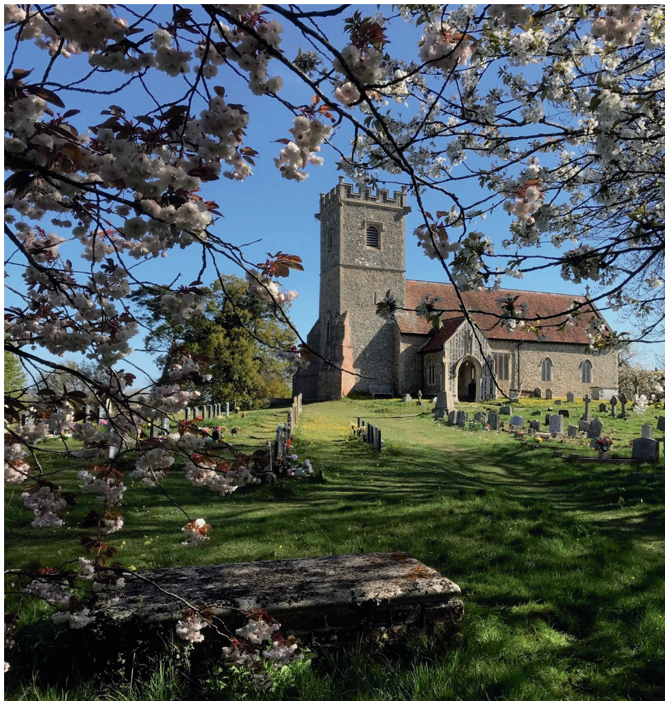
Spring at St. Mary's