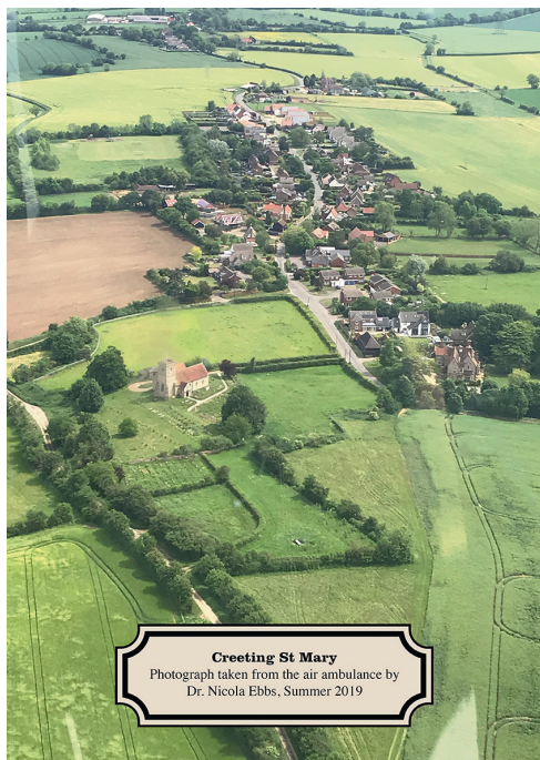
Creeping St Mary