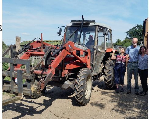
a local workhorse