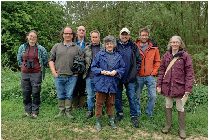
Site Assessment Team

We would ideally like to assemble a team of perhaps 6 to 8 volunteers to undertake the works. We are holding an event at the site while the orchids are in flower so members of our community, can come and see the site, to understand what we plan to do and what the benefit for wildlife will be.