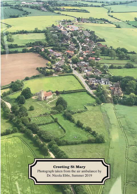
Creting St Mary