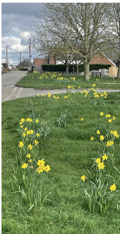
Spring is busting out all over!