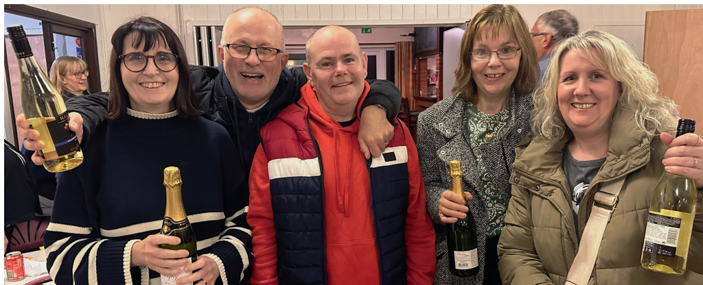
The Animals, winners of the quiz at the Village Hall