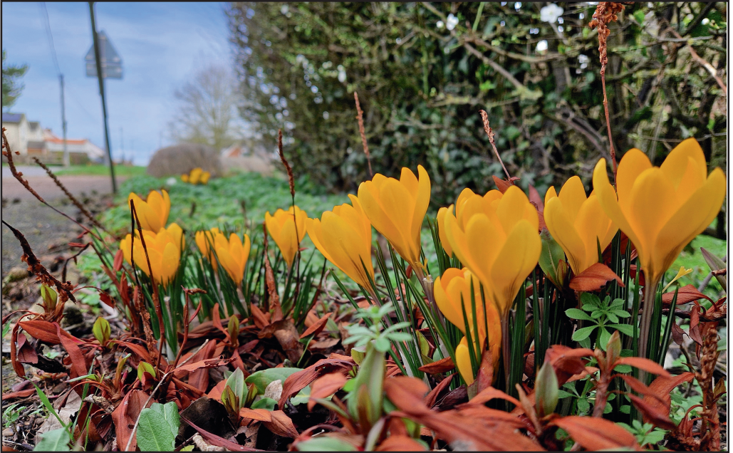
Spring - but with Autumn leaves lingering