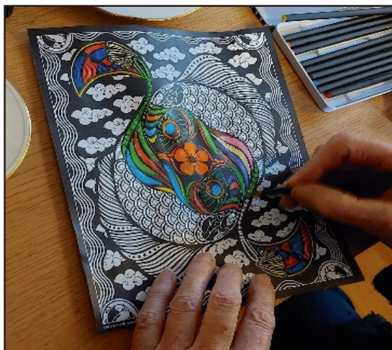
WI crafts