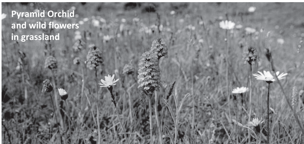
Pyramid Orchid and wild flowers in grassland

Ed.: As the area is special for lots of different wildlife and plants unusual in the area, please limit disturbance and keep dogs under close control.