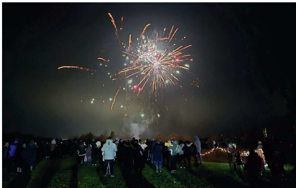
Brilliant Fireworks!