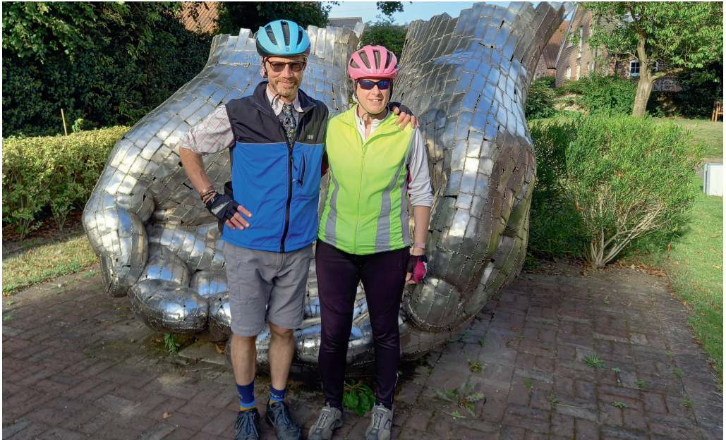
Ride and Stride Church Fundraisers: last stop of the day at Woodbridge Quay Church