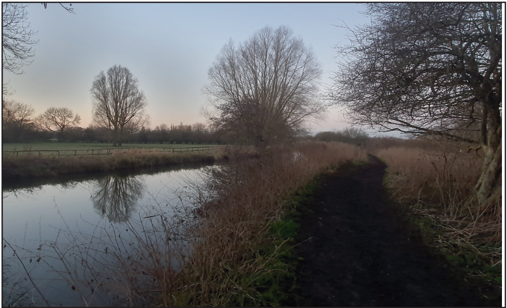
A favourite walk on the River Gipping